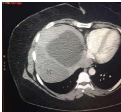
Axial CECT examination image showed no obvious enhancing solid components