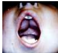
Figure (2): Bilateral intra-oral palatal bony swelling and downward bulging

bucco-palataly and striking intra-oral bilateral palatal bony swelling and downward bulging.