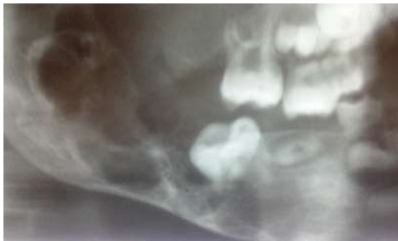
Figure (4): Multi-locular cystic lesions of the mandibular right side ranging from the condyle down to the ramus below the coronoid process downward to the angle of the mandible, then to the body