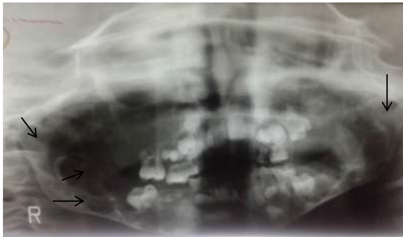
Figure (3): A panoramic view showing multi-locular cystic lesions involving the maxillae and the mandible ( arrowed ), the right condyle is affected , however , the left one is intact (arrowed) , with maxillary and mandibular deciduous teeth mal-alignment and anterior teeth shedding off