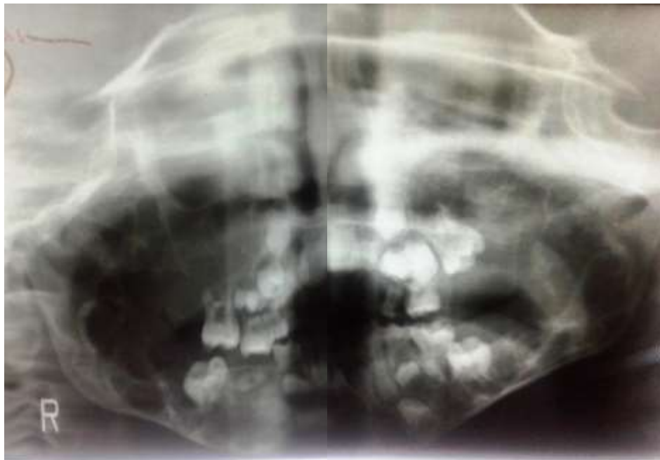
Figure (6): Comparison between right and Left maxilla and mandible sections of the panoramic view showing

The multi-locular cystic lesions at the left side at the angle and body of the mandible, with the left side less severity than the right side which shows more destructive multilocular lesions at the right maxillary