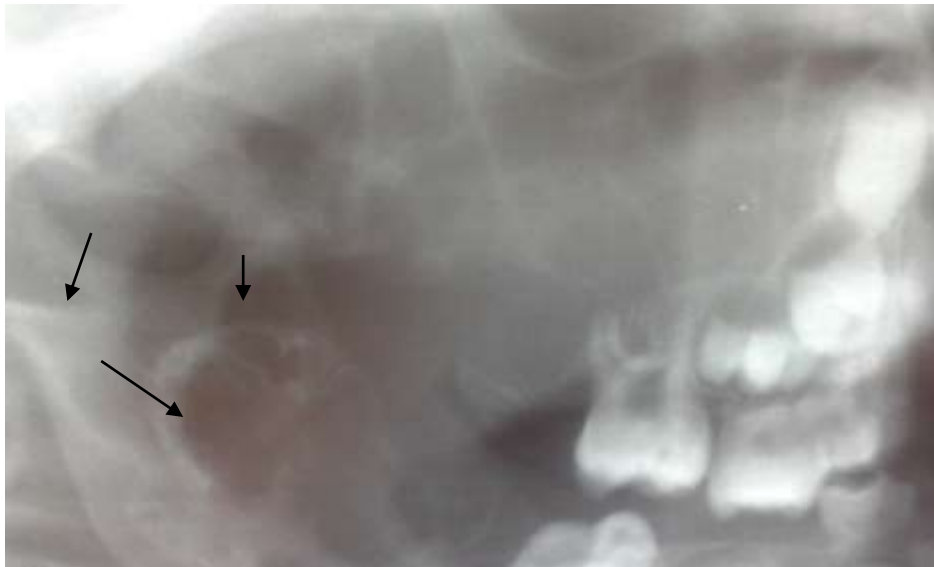
Figure (5): Showing the multilocular cystic lesions starting in the ramus of the right mandible at the level of the sigmoidal notch, sparing the coronoid, however, the right condyle is also involved (arrowed) .The right maxilla shows multi-locular cystic radiolucency