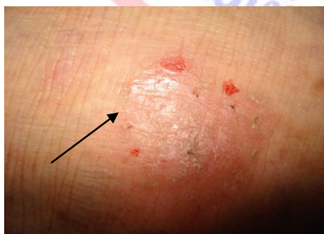
Leg eczema (pre-treatment)

Significant correlation, P value ( P < 0.05 ).