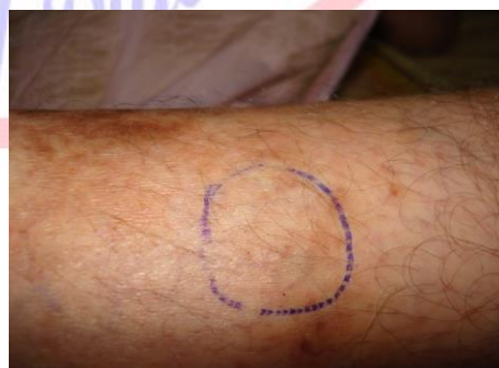
Leg eczema (post-treatment)