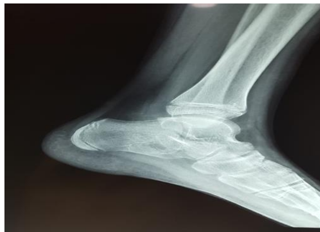
Figure (4): Post – operative X – ray, 45 days after treatment.

The result of histopathological examination of UBC biopsy was confirmed the cyst to be SBC by appear the area have fibrous membrane, spindle cells and occasional cells.