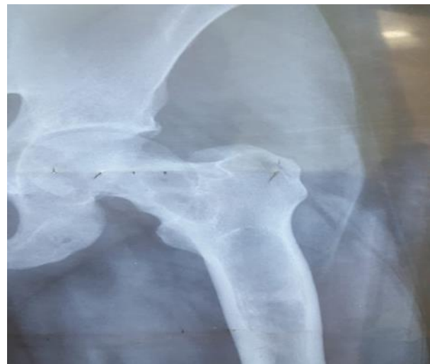
Figure (2): Unicameral bone cyst in the femur neck and subtrochanteric area in the mature patient.