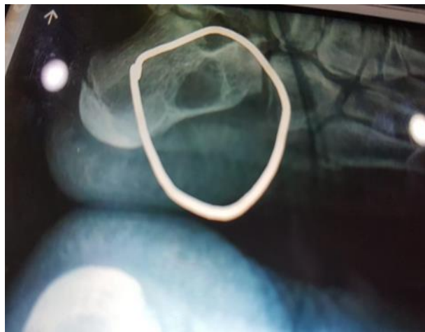
Figure (1): Pre-operative X-ray of unicameral bone cyst in calcaneus.