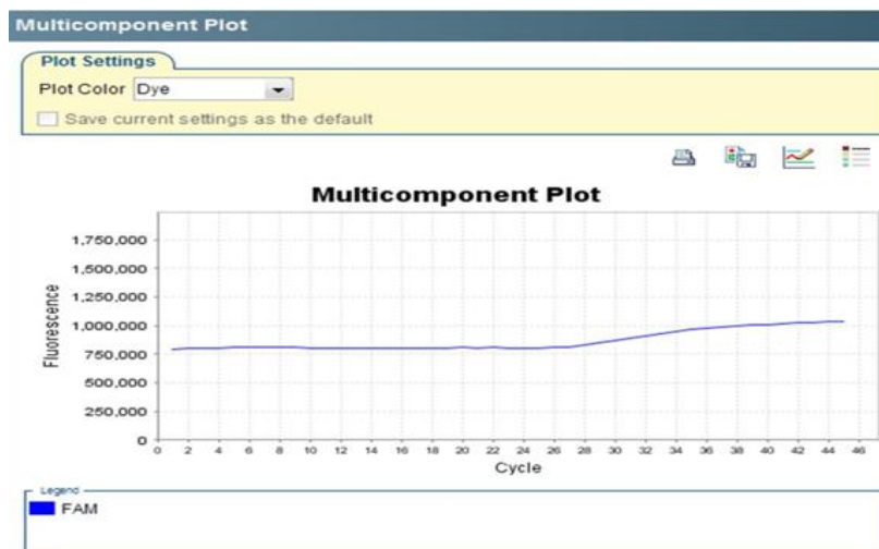
Figure (1): Real time PCR of human respiratory syncytial virus.