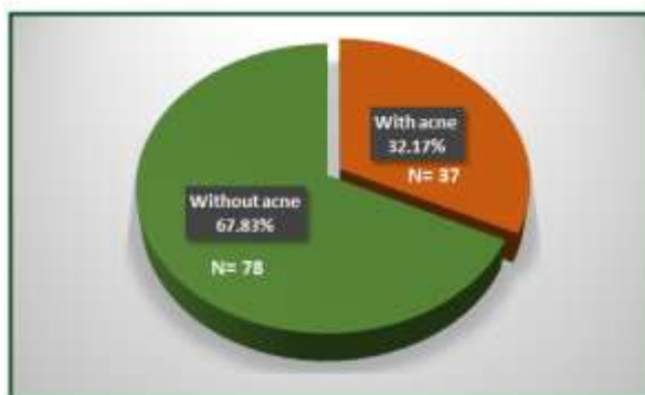
Figure (1): The prevalence of maskne among health workers with maskne.

Out of 115 healthcare workers with daily use of the mask rolled in the study, 37(32.17%) were suffering from new-onset mask induce acne Figure (1). Of those 10 men (27.0%) and 27 women (73%). The male-to-female ratio was 1:2.7. The mean age of the participants was 35.5±7.3 years (range: 24-47). Twenty-one cases (56.76%) were doctors, 8(21.62%), were pharmacist, 5 (13.51%) nurses, and only three (8.11%) were analysts Table (1).