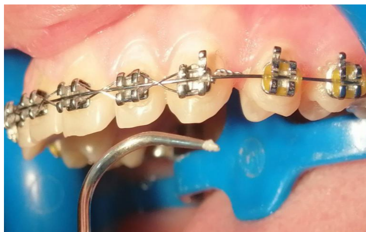
Figure (2): Dental plaque biofilm sample

All teeth surfaces including distal, facial, mesial and lingual\ palatal of the entire dentition was typically examined by starting from the upper right second molar and continued over the midline of the jaw to the upper left second molar. Regarding the teeth which are located on the right side of the jaw midline, the sequence of examination might include distal, facial and mesial, and the opposite was true for the teeth which are located on the left side of midline where the sequence of examination might include mesial, facial, and distal. Concerning the palatal surface of the entire dentition, they