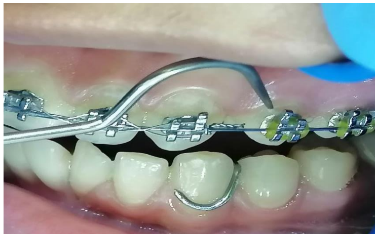
Figure (1): Dental plaque biofilm scoring immediately adjacent to gingiva margin